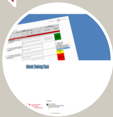
Stock Taking Tool (2017)

Sharing lessons learned and incorporate experiences