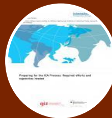
Preparing for the ICA process: Required efforts and capacities needed (2017)