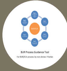
BUR Process Guidance Tool (2016)