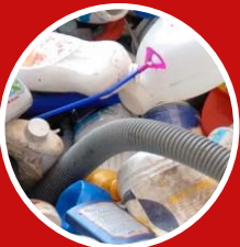
Good Practice Study on GHG-Inventories for the Waste Sector in Non-Annex I Countries (2015)