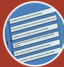
Guidance for setting up and enhancing national technical teams for GHG inventories in developing countries (2017)