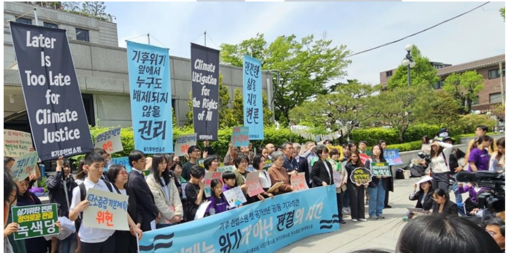
Some of the plaintiffs bringing their case to the court